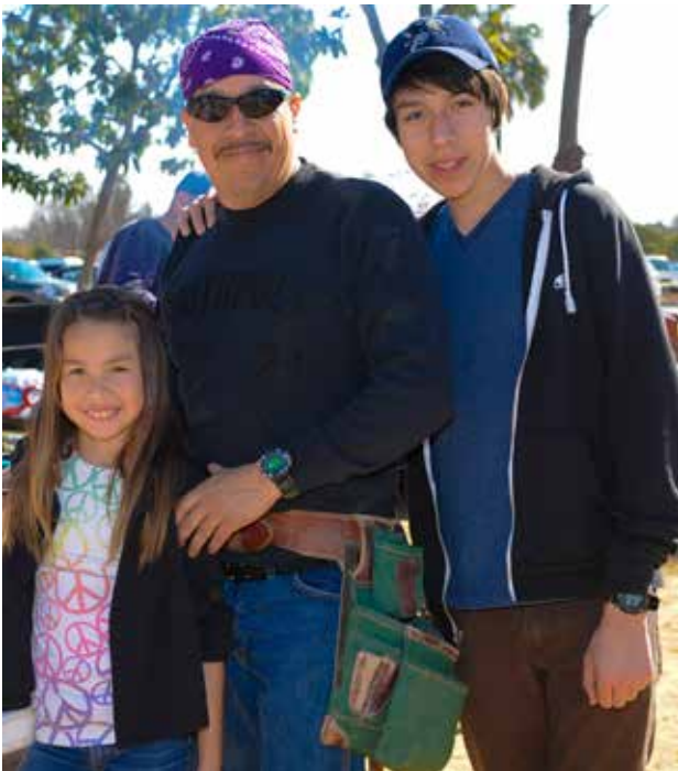
February 2012, Volunteer Day at Rescue the Children.

Over 1,000 volunteers generated thousands of volunteer hours, in addition to the 1,680 volunteers that worked on the Rescue the Children renovation project. Local businesses, organizations and media sponsored events and fund raisers to generate awareness about the Fresno Rescue Mission. We were invited to ministry and community fairs, men's and women's retreats, and Christian concerts. There are so many ways you chose to engage your time and resources for the Mission. The ultimate benefit is changed lives for the men, women and children we serve. Thank you!